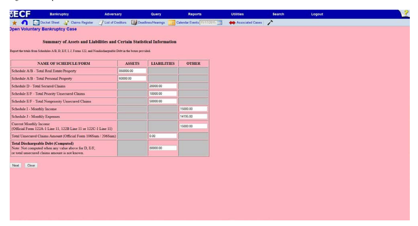
Figure 2 - Completed

We encourage you to share this document with those on your staff who assist with e-filing. If you have any questions, please call our Help Desk before you file that document. The numbers are 347-394-1700, then press 6 (Brooklyn) and 631-712-6200, then press 6 (Central Islip).